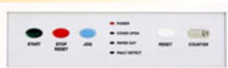
User Friendly Control Panel

The FD 2030 processes forms at a rate of up to 9,000 sheets per hour and can hold up to 225 - 24# forms in the feed hopper. Combined with a duty cycle of up to 75,000 forms per month the FD 2030 offers the ultimate solution for streamlining your in office paper processing.