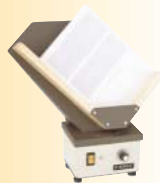
The FD 400 Jogger is a recommended option that reduces static electricity from forms and aligns them for proper feeding.